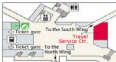
← Ticket counter at JR Narita Airport Station (Terminal 1)