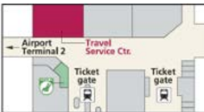
← Ticket counter at JR Airport Terminal 2 Station (Terminal 2)