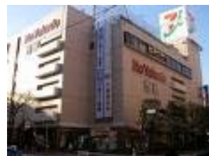
Pictures (from left to right): JR Chuo Line, Musashisakai Station, and Ito Yokado (West)