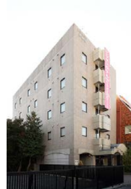
From Left: Entrance, front desk, and exterior of Citytel Hotel