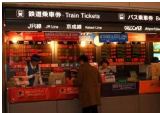
← Ticket counter in Arrival Lobby (Both at Terminal 1 and 2)

*The ticket is the same from both Terminal 1 and 2.