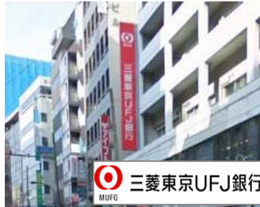
② Bank of Tokyo Mitsubishi UFJ