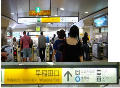
① Exit from “Waseda Exit (早稲田口)” ticket gate at JR Takadanobaba Station