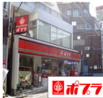
⑤ Pass Poplar (ポプラ) – convenience store on your left.