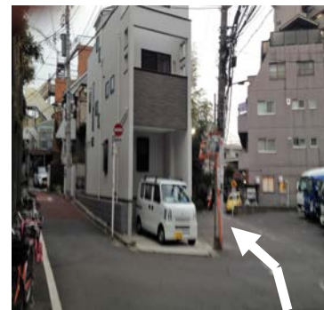
⑥ Go right at the fork (Y-intersection)