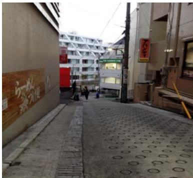
④ Go down the slope