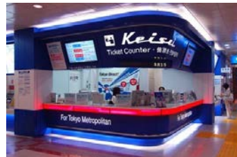
← Ticket counter on B1 floor next to the Keisei line ticket gates (Both at Terminal 1 and 2)