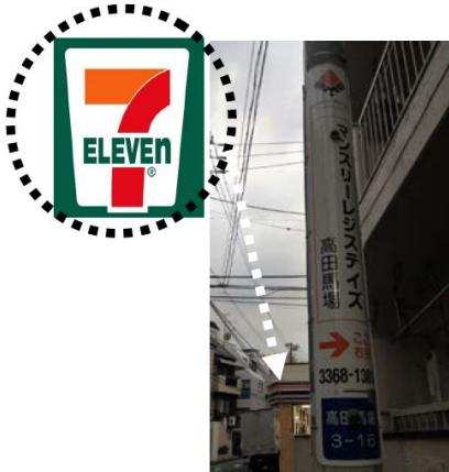
⑦ Turn right at 7-11 Convenience Store